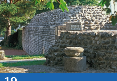
19 Fort wall