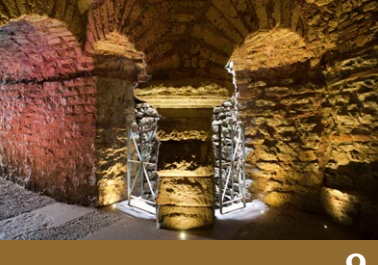
9 Bath complex and well house