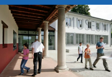
1 Museum with Roman house