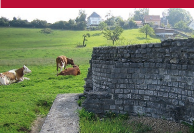
11 Sanctuary on Grienmatt