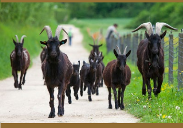
15 Animal park