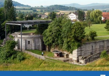
7 Basilica and curia