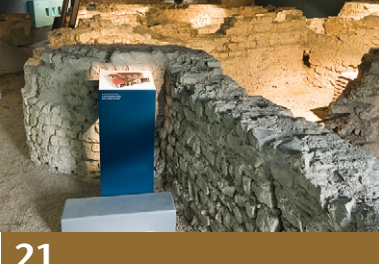
21 Early church