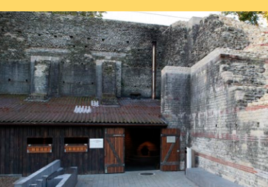
2 Temple retaining wall and bakery