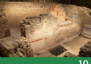
10 Commercial buildings